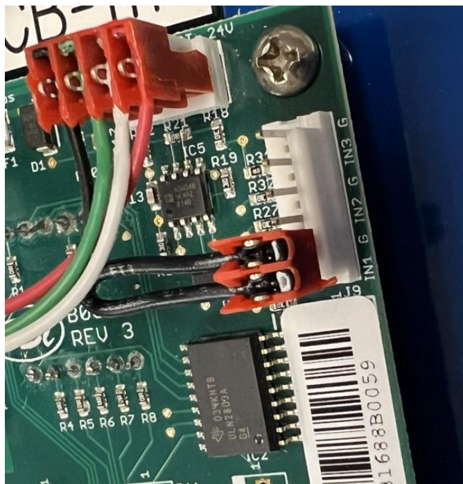
Jumper for Celsius mode

The dew point of the gas in the sample line is displayed on the front panel. The reading is in Fahrenheit by default. Placing a jumper on pins "In1" and "GND" of J9 on the display board (see below) will switch the unit to Celsius. A light on the front of the enclosure will indicate the display's operating mode.