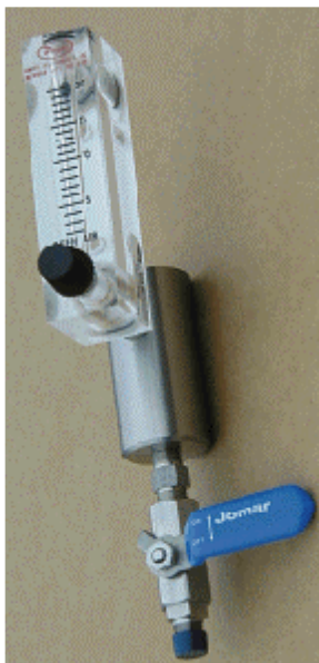
PN 13123 Remote Mounting Assembly

For best results, the sensor should be mounted directly in the measured gas line. This will ensure that it remains in a low-dew atmosphere which will decrease the measurement response time. The sensor is fitted with ½" Male NPT threads. If the sensor is not going to be mounted directly in the gas stream, it should be installed in the Remote Mounting Assembly (SSi Part Number 13123), which can be purchased separately. Although this installation does allow for some design flexibility, it is important that only stainless steel tubing and fittings are used to carry the sample gas to the sensor. When installing the unit, verify that all fittings are tight, since any leaks will cause inaccurate readings.